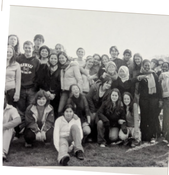
Class of 2006

Today, you have the chance to reach back and pull the next generation forward.