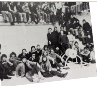
Class of 1976