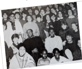
Class of 1986