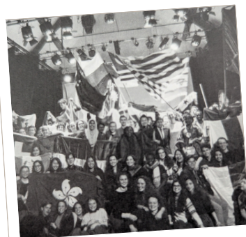
Class of 2016