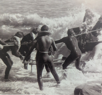
Class of 1966