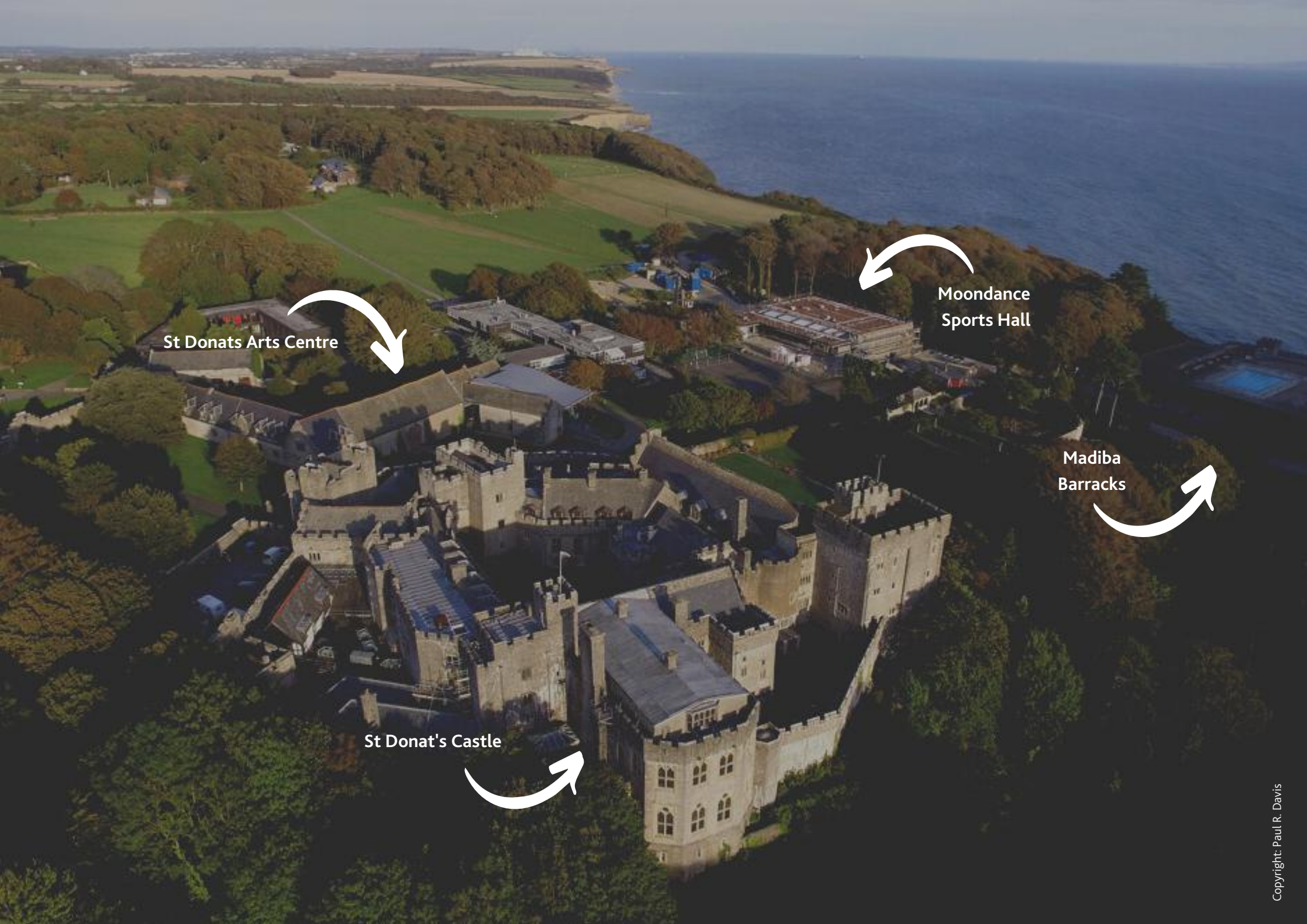
St Donats Arts Centre