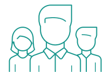
A practice of personal reflection