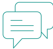
Conversations with inspirational global social and sustainability leaders