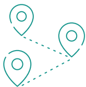
Visits to impactful local community initiatives