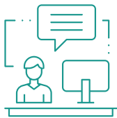
Thought-provoking experiential workshops