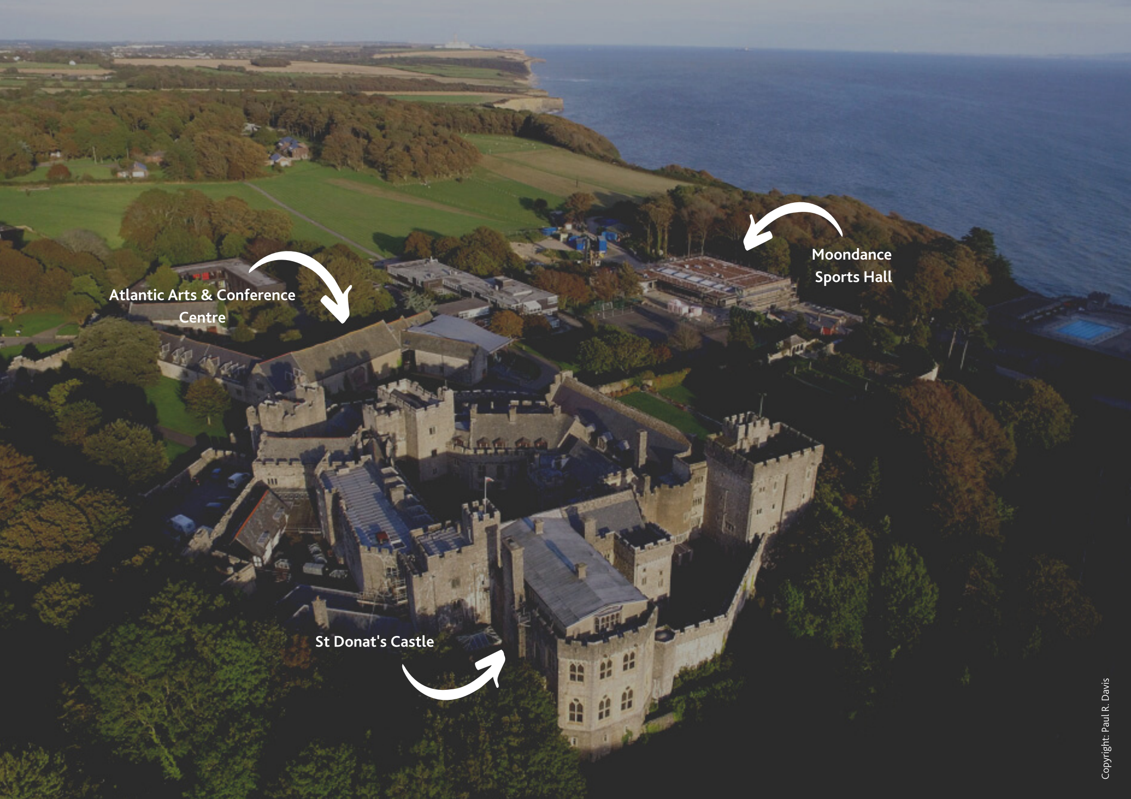
Atlantic Arts & Conference Centre